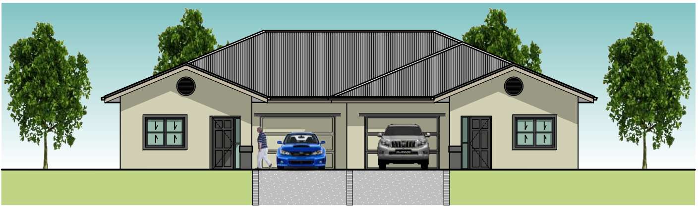
front elevation SCALE 1:150 @ A4